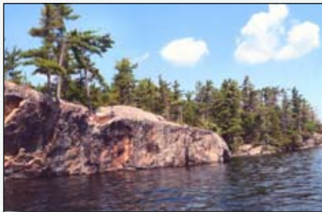
Rugged granite shores on the Frontenac Arch