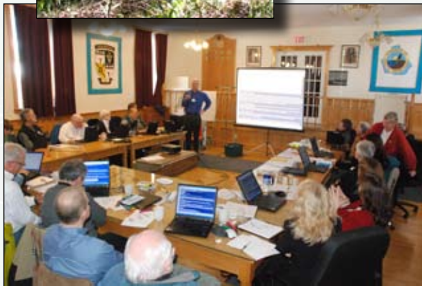
above: GPS data collection for trails mapping below: Sustainable tourism workshop in Sydenham