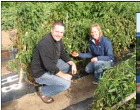
Chef meets farmer through Local Flavours