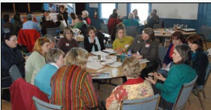
Marketing strategies workshop for artists and artisans in Athens