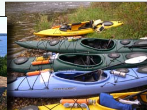
Follow a 4,000 year-old paddle route