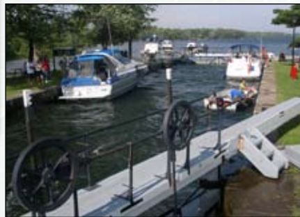
Narrows Lock on the Rideau Canal