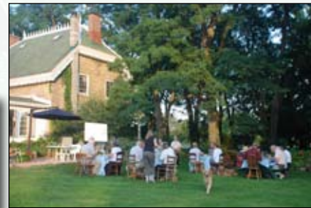
Celebrating our community and heritage