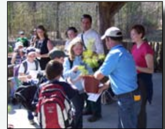
Students celebrate Earth Day