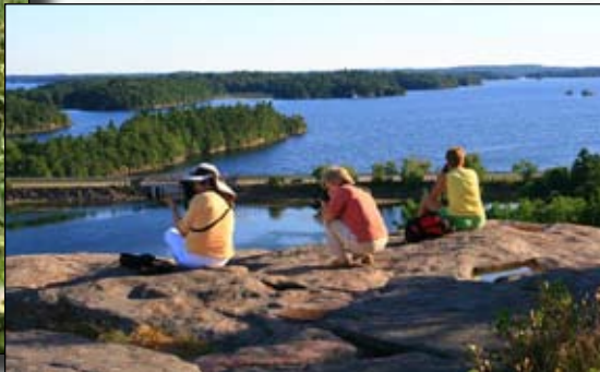
Views at Landon Bay